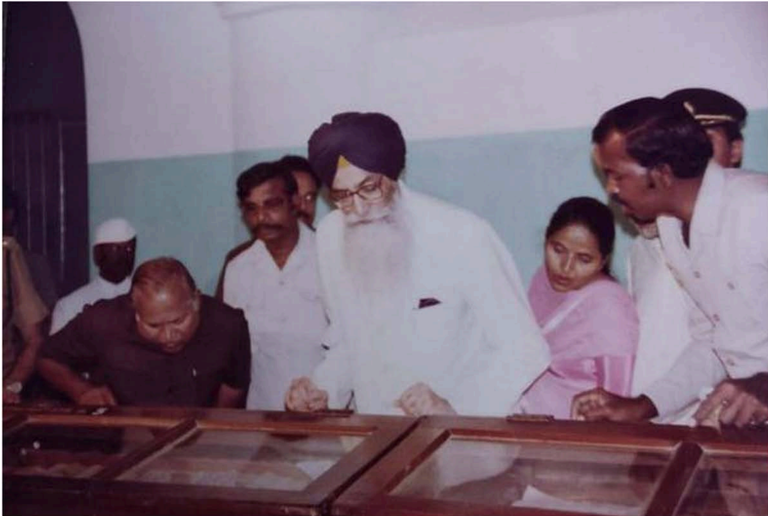
Surjit Singh Barnala, former Governor of Tamil Nadu at the TMSSML