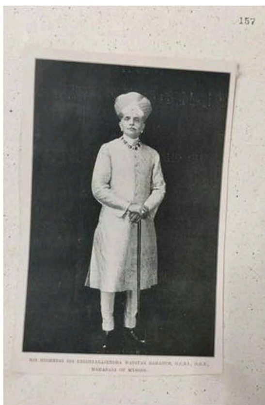
Krishnaraja Wadiyar IV, maharaja of Mysore